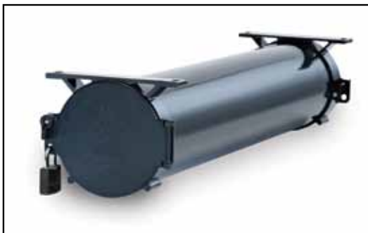
Lockable for secure storage (lock not provided)

D&W Inc.'s new and versatile Super-Tube can be mounted undercarriage or under the frame tongue. Super-Tube opens on both ends for super-easy access. Unlike screw-in plugs, which often bind and stick, our built-in mounting bracket/hatch assembly features roadworthy hatch-type doors with a positive latch that operates easily in tough, dirty undercarriage environments. The Super-Tube's roomy 4 5/8" diameter allows for storage of sewer hoses with fittings attached or is the ideal place to stow fishing poles and similarly shaped gear. D&W Inc.'s sturdy new Super-Tube is made of tough heavy-duty black polymer that will blend perfectly with the RV and is available in any length up to ten feet.