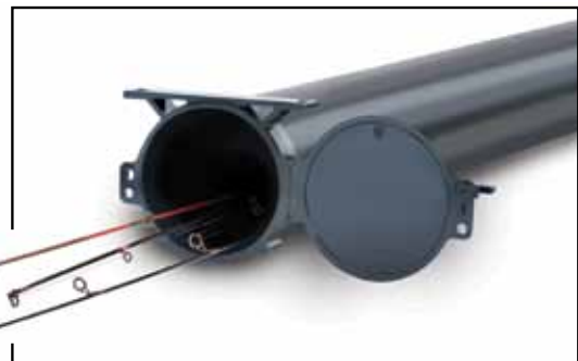
Provides additional storage