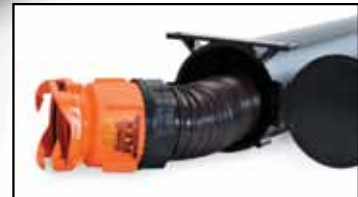
Allows for the biggest hose fittings!

D&W Inc.'s new and versatile Super-Tube can be mounted undercarriage or under the frame tongue. Super-Tube opens on both ends for super-easy access. Unlike screw-in plugs, which often bind and stick, our built-in mounting bracket/hatch assembly features roadworthy hatch-type doors with a positive latch that operates easily in tough, dirty undercarriage environments. The Super-Tube's roomy 4 5/8" diameter allows for storage of sewer hoses with fittings attached or is the ideal place to stow fishing poles and similarly shaped gear. D&W Inc.'s sturdy new Super-Tube is made of tough heavy-duty black polymer that will blend perfectly with the RV and is available in any length up to ten feet.