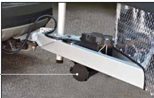
Can be hitch-frame mounted